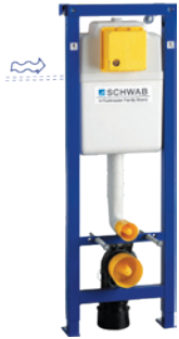
DUPLO WC 380 IN.CON. 16x2 112cm