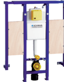
DUPLO WC 380 L SP