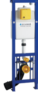
DUPLO WC 380 VARIO