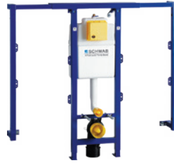
DUPLO WC 380 L